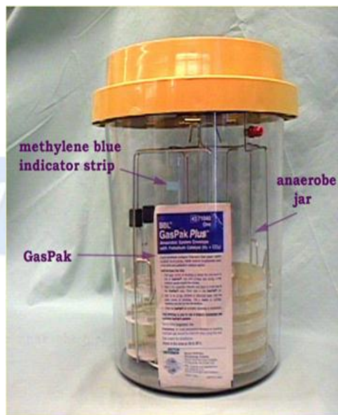
An aerobic jar