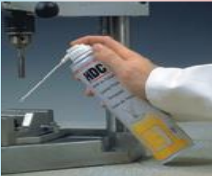
Metal cutting oils